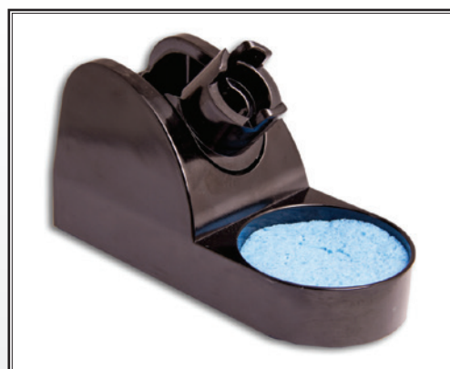
Safety Stand ST6A