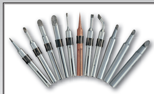
Replacement Bits - MK2 series