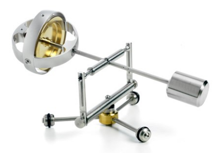
Note: Gimbals add on kit only

This configuration is very similar to the previous configuration but with the counter weight added. Again try experimenting with the positioning and see what happens.