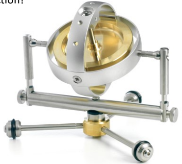
Note: Gimbals add on kit only

This configuration uses most gimbal parts and is ideal to learn some of the fundamentals of gyroscopes. Move the gyroscope around while it is not spinning and then spin it up using the electric motor. Move the gyroscope the same as before and see what happens. You can also try holding the entire gyroscope and gimbals while it is spinning on the palm of your hand. Point the gyroscopes axle north. Now walk around the room in a circle. Did you notice how the gyroscope continues to point in the same direction?