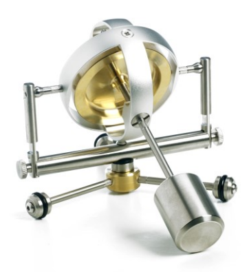
Note: Gimbals add on kit only

This is the same as configuration 3 but utilises the counter weight. Notice the difference with and without the counter weight. Try the counter weight on the end of an extension rod (as shown) and directly connected to the gyroscope.