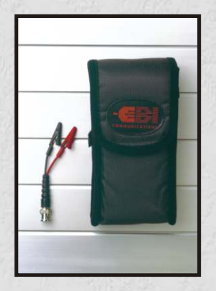
Complete with toolbelt holster and croc clip adaptor